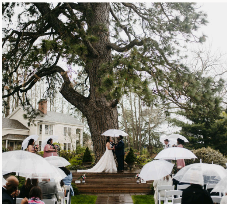
NAJI SAKER PHOTOGRAPHY